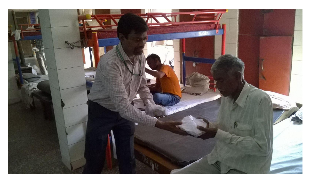
Distribution of food packets at Rain Basera opposite AIIMS

Like all previous years, Gandhi Jayanti was celebrated in ISTM with full respect and enthusiasm, gaiety and much fanfare on 02<sup>nd</sup> October, 2015 by the members of the staff, faculty and trainees in ISTM. Under the leadership of Director, ISTM herself the group distributed food packets among the needy and destitute to grace the occasion in a befitting manner.