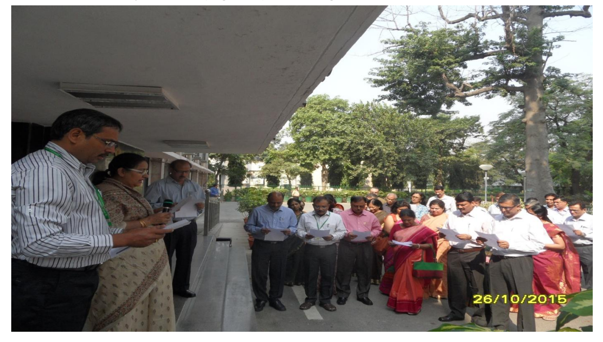
Pledge Taking Ceremony on 26<sup>th</sup> October, 2015